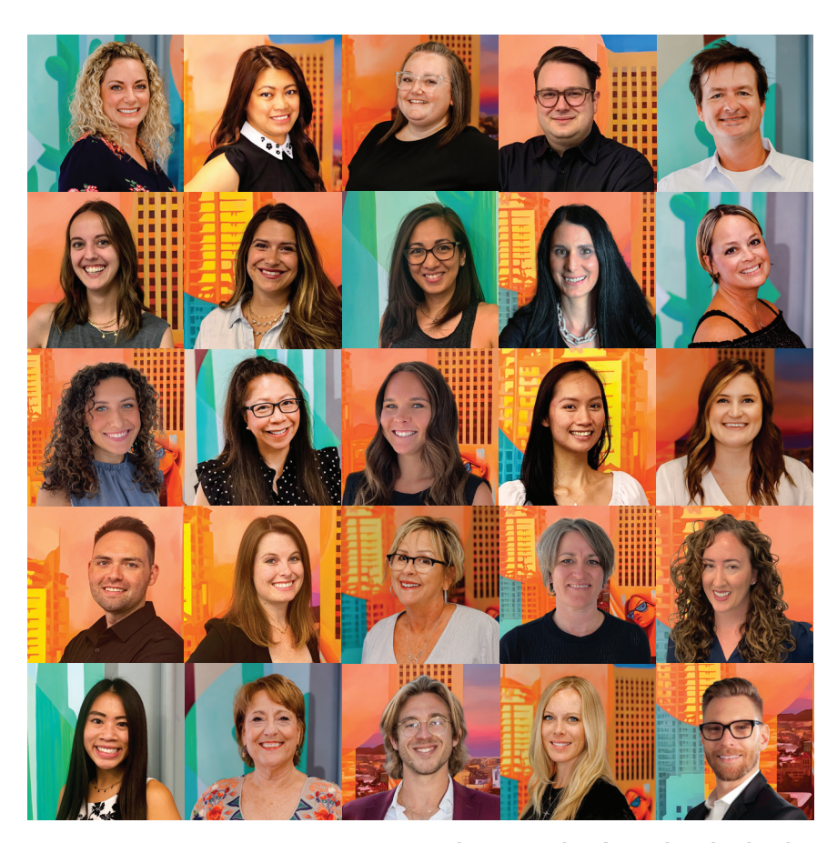
FROM LEFT TO RIGHT, TOP TO BOTTOM